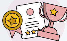
Team Wellbeing Challenges